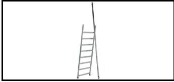
Extensions set for single towers s-1178 5929674