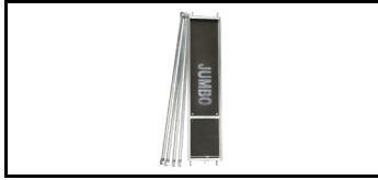
Platform Sets w/Railing 101781sk 5929707