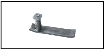
Storm lock 1003050231