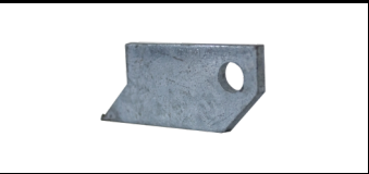
Flat bar lock