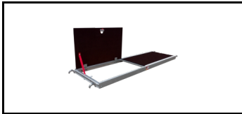
Platform w/hatch 1001781 7782857