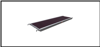
Platform w/o hatch 1001780 7782840