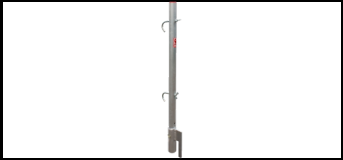
JUMBO-Safe Post 38JS106