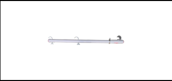
Handrail post BRO-søjle 5246121