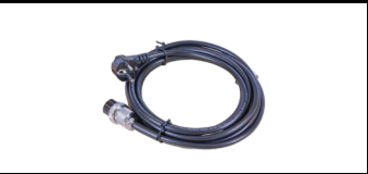
Power cable 5 m. 38CWS80EL