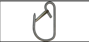
Hook 38GEDA1408 1386840