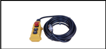
Controller w/ 10 m. Cable 38CWS80STYR