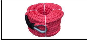
Rope 1560025 1886016