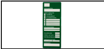
Scaftag Insert 15SHSDA 1678718