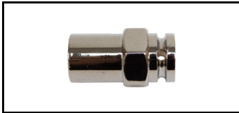
Key for special coupler