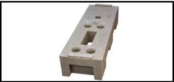
Rubber footing 35BH101 5640183