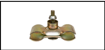
Special Coupler 35BH111 1963732