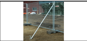
Outrigger 35BH103 1849514