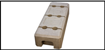
Concrete footing 35BH100 5640182