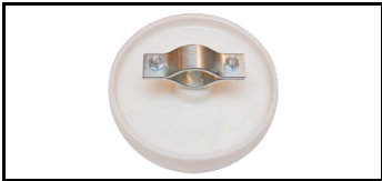
Wheel for fence 35BH013 1528853