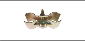
Building fence Coupler 35BH102 5741579