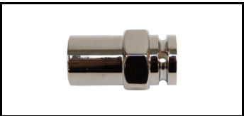
Key for special coupler 35BH112 1963733