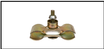
Special Coupler 35BH111 1963732