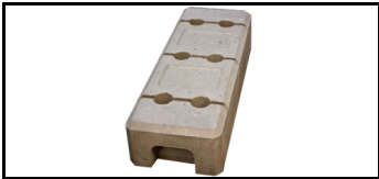
Concrete footing 35BH100 5640182