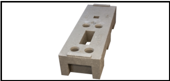
Rubber footing 35BH101 5640183