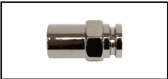
Key for special coupler 35BH112 1963733