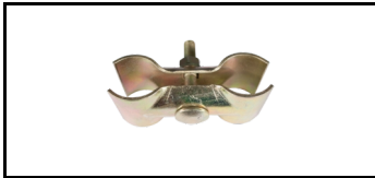
Building fence Coupler 35BH102 5741579