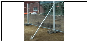
Outrigger 35BH103 1849514