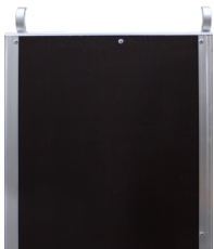
Non-slip platforms equipped with staggered hooks, which makes lengthwise extention without displacement possible