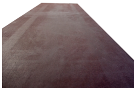
Waterproof, non-slip, platform in Finnish plywood. Pure birch wood, mounted in strong aluminum profiles