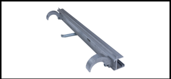
End piece 100305023