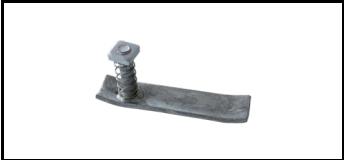
Storm lock 1003050231