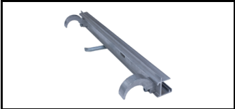
End piece 100305023