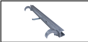
End piece 100305023