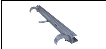
End piece 100305023