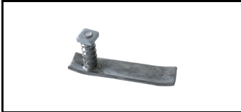
Storm lock 1003050231