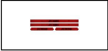
Toeboard Sets 1620305b 5741553