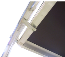
Placed at each end under the platform, the patented storm locks are used to secure the platform to the scaffold