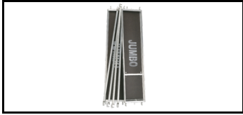
Platform Sets w/Railing 103051BK 5741562