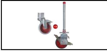
Exchanges castors 1400204 7782766