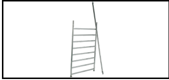
Extensions set for double towers b-1305 5929673