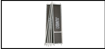
Platform Sets w/Railing 103051BK 5741562