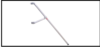
Outrigger 1410150 7782741