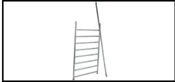
Extensions set for double towers b-1305 5929673