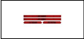
Toeboard Sets 1620305b 5741553