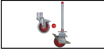
Exchanges castors 1400204 7782766