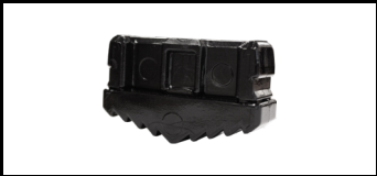
Rubber foot 4141010