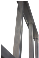
35 mm wide aluminium profile steps