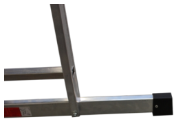
Fixed stabilizer with feet in impact-resistant plastic secures good stability