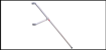
Outrigger 1410250 7782758