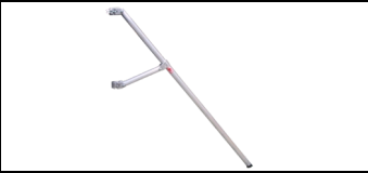
Outrigger 1410150 7782741