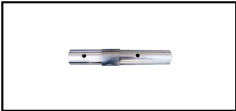
Connection piece 1420100 5929684