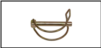
Pins 1600150 1607280