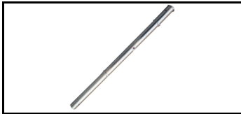
Handrail post 1540100 5929690