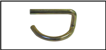
Safety clips 1600100 5929697