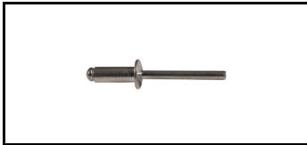
Pop rivet 41JSS904