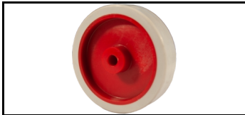
Wall Wheel 41JSS909