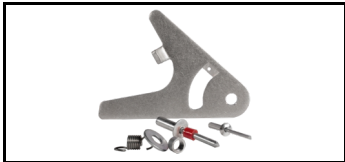
Step lock set 41JSS906