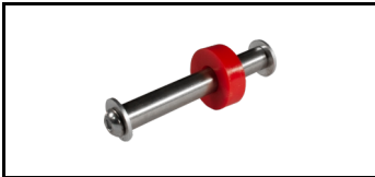
Bolt set 41JSS909B