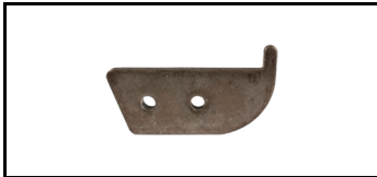
Bottom bracket 41JSS905