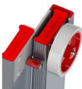
Durable top wheel & nylon fittings in aluminium mounts secure fast & easy extension