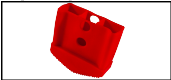
Rubber foot 41JSS900