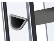
38mm ergonomic, angled & non-skid steps, for a plane and safe standing ground