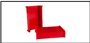
Inner lining 41JSS922