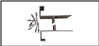
Top clips set 41JSS907