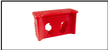
Top plug 41JSS912