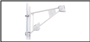
Swivel Arm 38GEDA1267 1741997