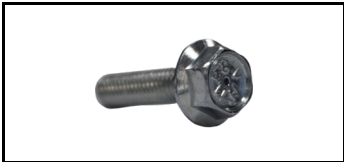
Screw 5,5x25 skrue Kl. 4