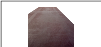
Plywood for platforms w/o hatch 7503000s