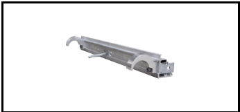
End piece 100305024