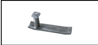
Storm lock 1003050231