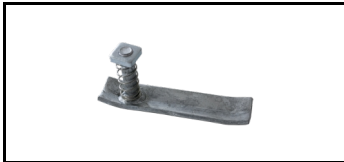
Storm lock 1003050231